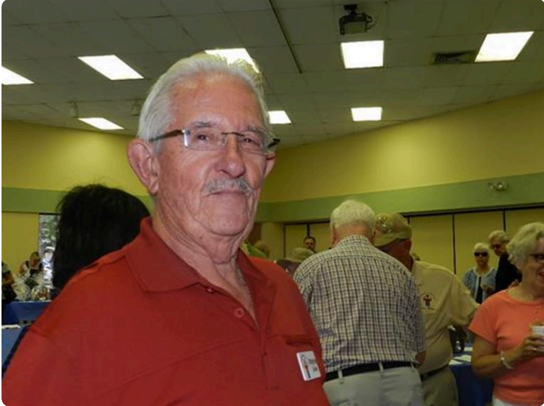
At the ToyMakers Silent Auction Fundraiser