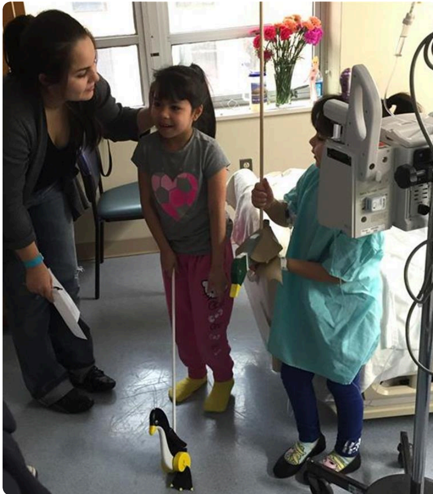
Tampa General Hospital delivery (Penguin & Duck)