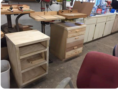
Cabinets under drill presses made by Wayne