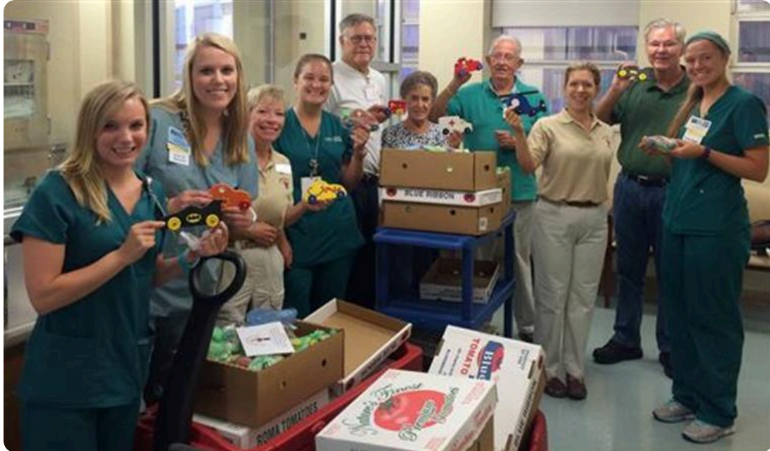
2015 Tampa General Hospital Delivery