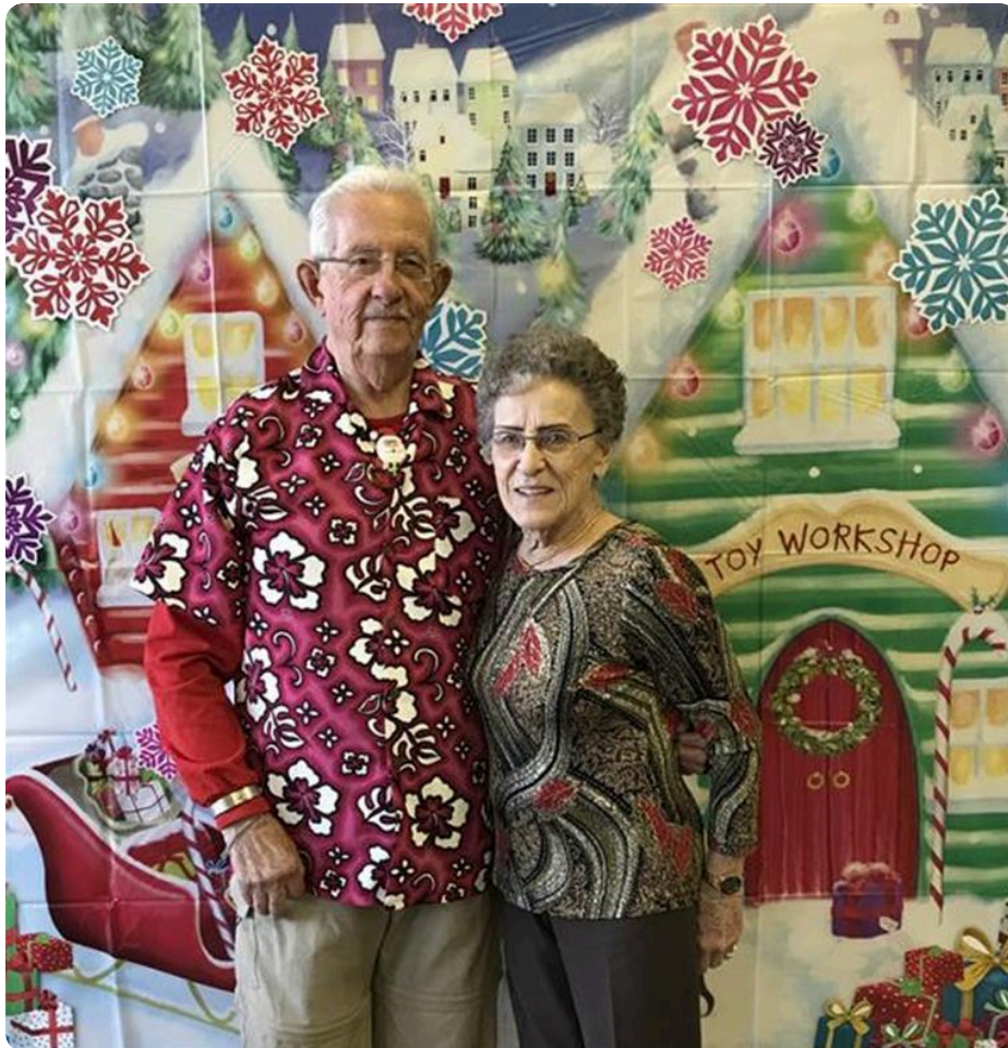
ToyMakers Christmas Party