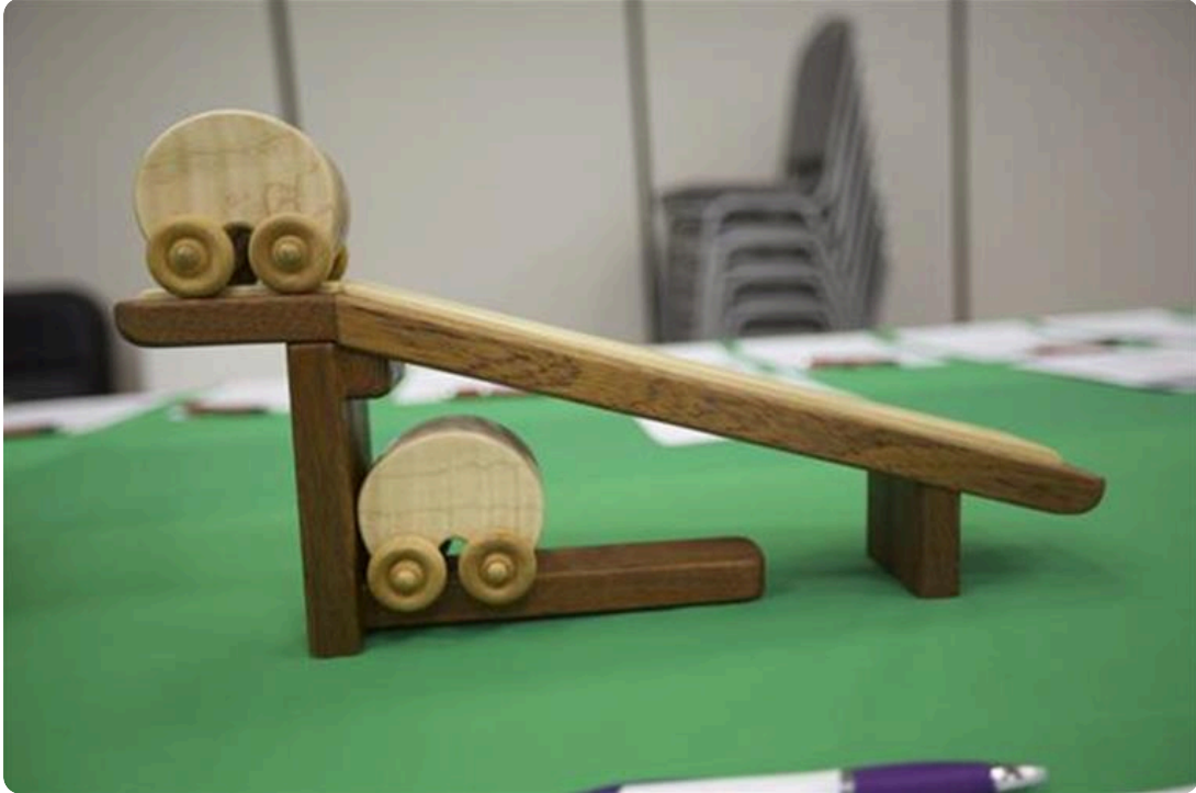
Ramp with Flip Cars